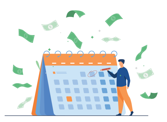
Every investor become owners to their proportion of investment & enjoies monthly income