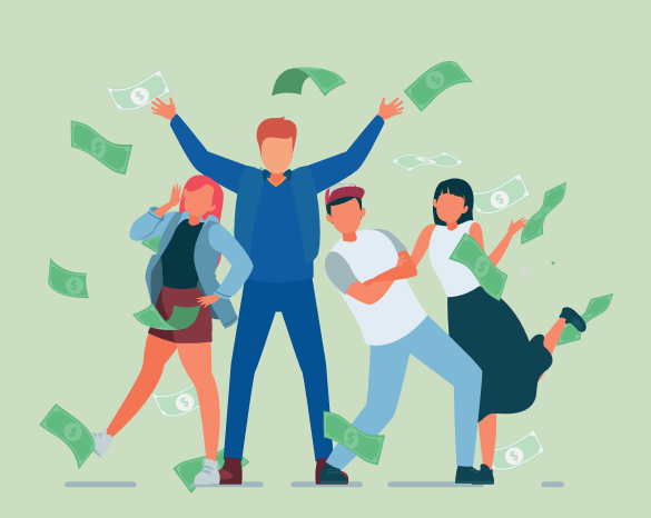
All investors get a portion of gain when the asset is sold